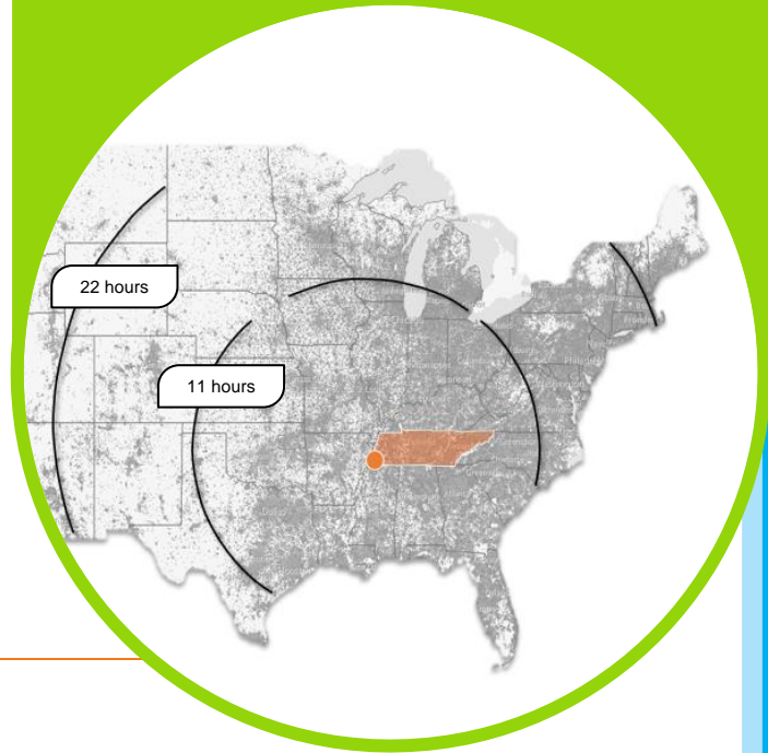
Population Density by Drive time Radius United States

Memphis's robust manufacturing sector spans a wide variety of products – from non-durable goods such as food and beverage and paper products to more precision based surgical and medical instruments and automotive component manufacturing.